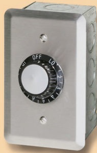
Part # 14-4100 (120V) - Part # 14-4200 (240V) Single SS Wall Plate w/Deep Gang Box (Includes INF Input Regulator)