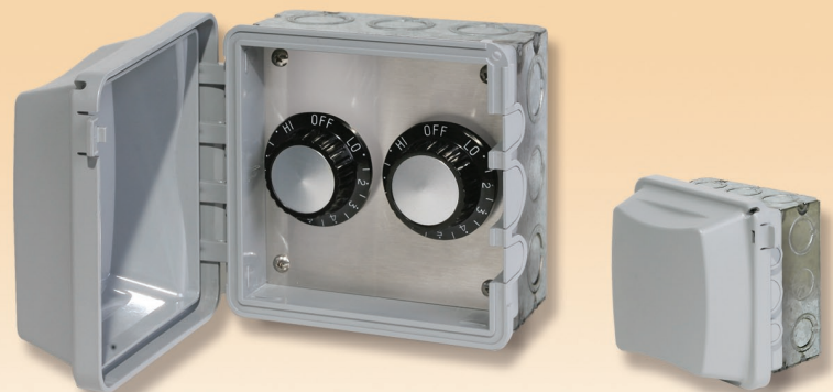
Part # 14-4115 (120V) - Part # 14-4215 (240V) Double Flush Mount w/Deep Gang Box (Includes Two (2) INF Input Regulators)