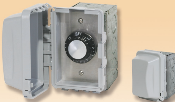
Part # 14-4110 (120V) - Part # 14-4210 (240V) Single Flush Mount w/Deep Gang Box (Includes INF Input Regulator)