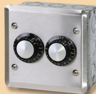
Part # 14-4105 (120V) - Part # 14-4205 (240V) Double SS Wall Plate w/Deep Gang Box (Includes Two (2) INF Input Regulators)