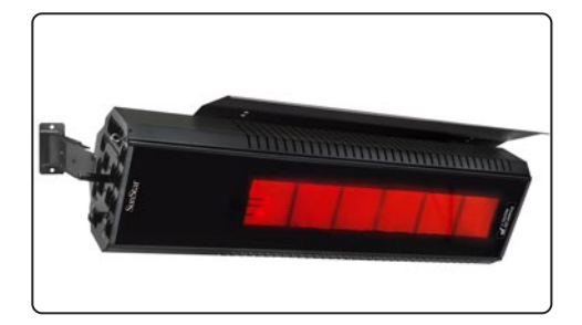
An optional Heat Shield can be installed to reduce the clearances above the heater

Like the radiant warmth from the sun, radiant heat warms people and objects directly at floor level without first heating the surrounding air. Customers can dine and relax under the radiant warmth of the GLASS,™ and help you to maximize the use of your seating areas during those colder winter months.