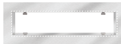
FLUSH MOUNT FRAME

Need help? We offer our customers comprehensive sales support and design assistance to help you select a system that will best meet your particular needs. To learn more, and to find a distributor near you, please contact us for prompt, professional service.