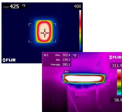
HEATING GREEN INFRARED EXAMPLES

Heating Green Systems Function Better and Save You Money